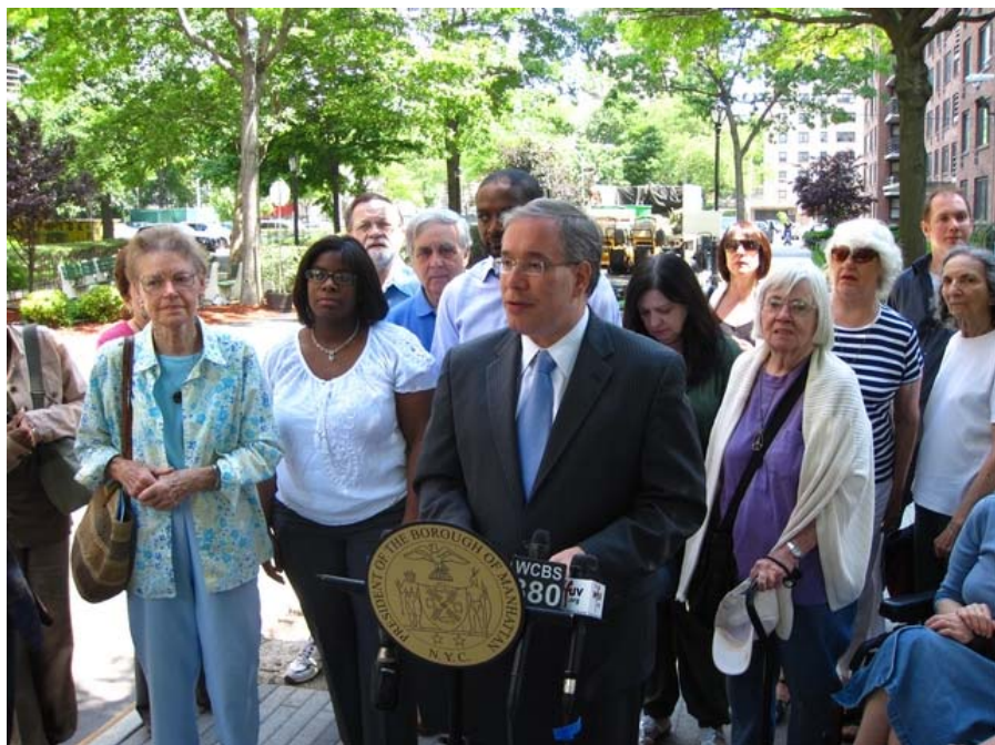
Borough President Scott Stringer says two-third of boilers that burn polluting heating oil are in rent-regulated buildings.