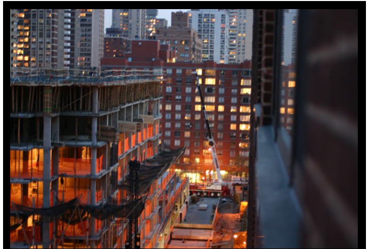
808 Columbus Avenue - April 23, 2008 8:10 pm

Watch for pictures in the next edition of The Park West Tenant .